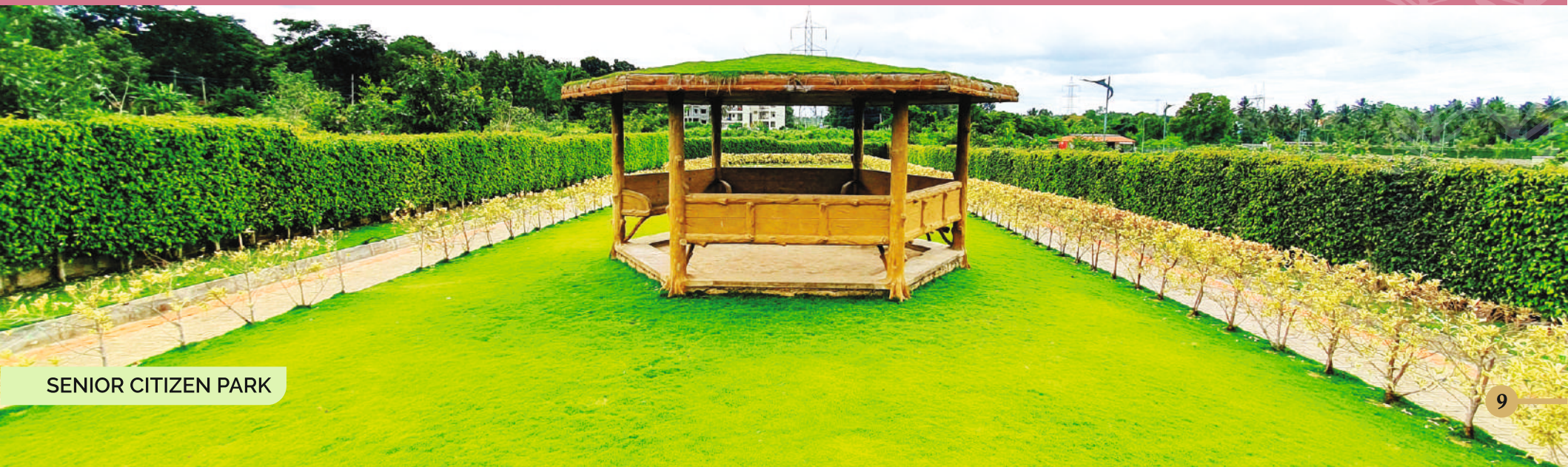
SENIOR CITIZEN PARK